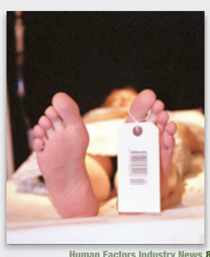
Human Factors Industry News 8

The Los Angles County, CA. judicial system employs a behavior program for people convicted of drunk driving to witness real-life consequences of drinking and driving. A person is charged with driving while intoxicated when their blood-alcohol content level is 0.08 percent or more. It requires the offenders to spend four hours at the morgue and four hours at a hospital emergency room.